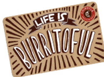
Chipotle® is not a sponsor or co-sponsor of this promotion.