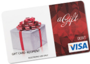
Visa® is not a sponsor or co-sponsor of this promotion.